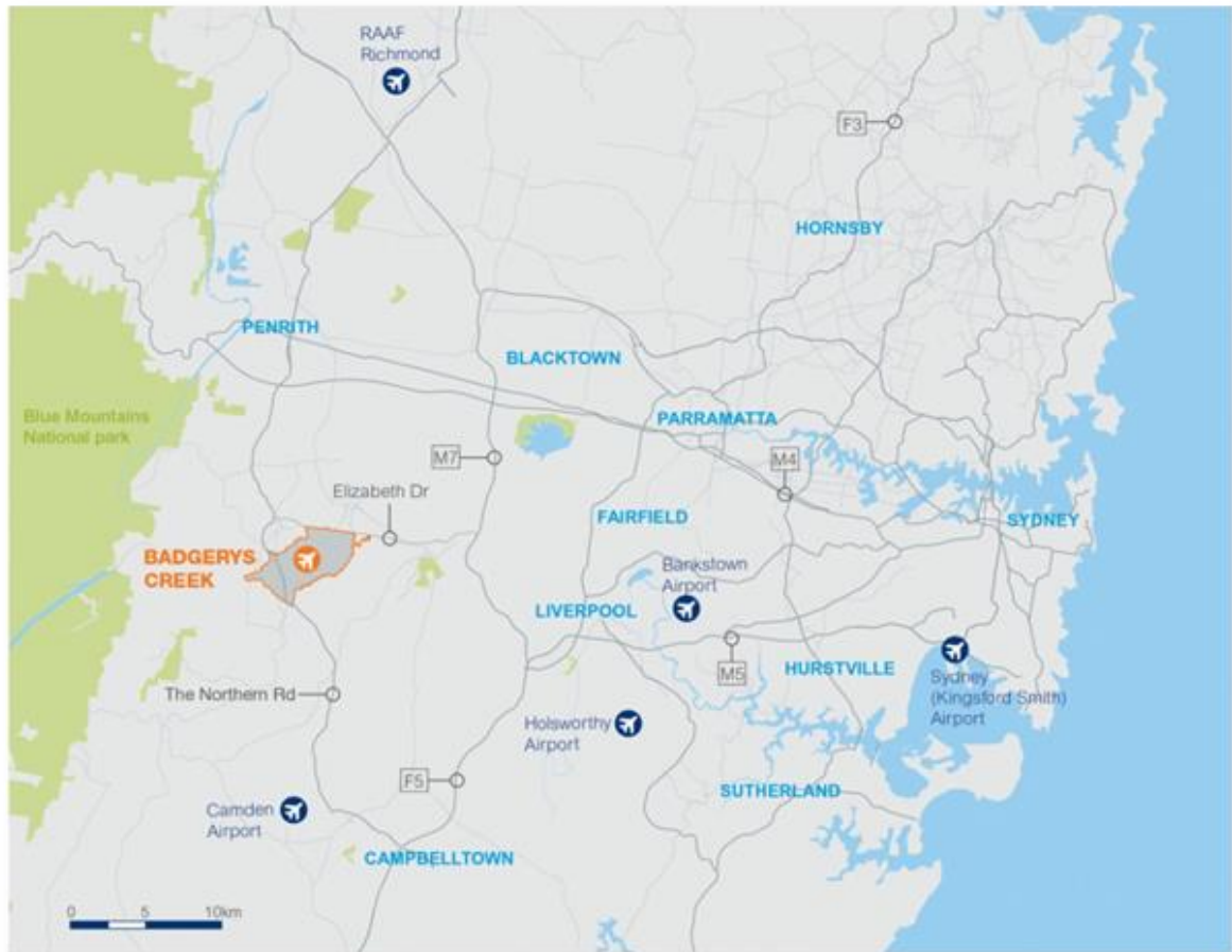
Figure 1-1 Airport Site location

The Airport Site is owned by the Commonwealth and is leased to WSA for the purpose of developing and operating Western Sydney International under an airport lease (Airport Lease). The Airport Site location is illustrated in Figure 1-1.