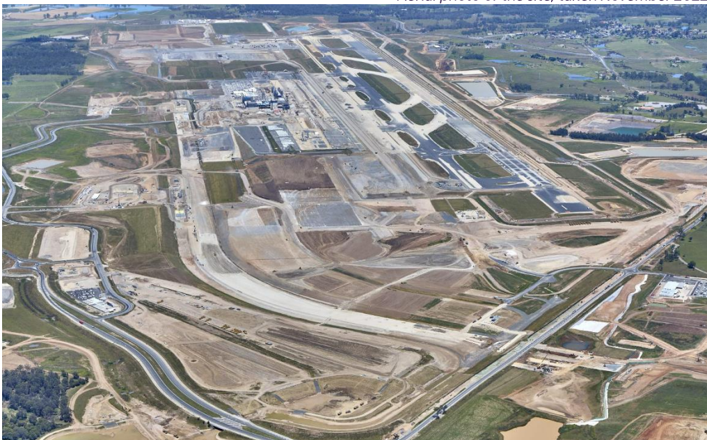
Aerial photo of the site, taken November 2022

On Saturday 19 November the Major Earthworks project hit their final million cubic metre milestone, with 25 million cubic metres of earth being moved! This is a massive achievement and in terms of strictly construction projects, the biggest ever seen in Australia!