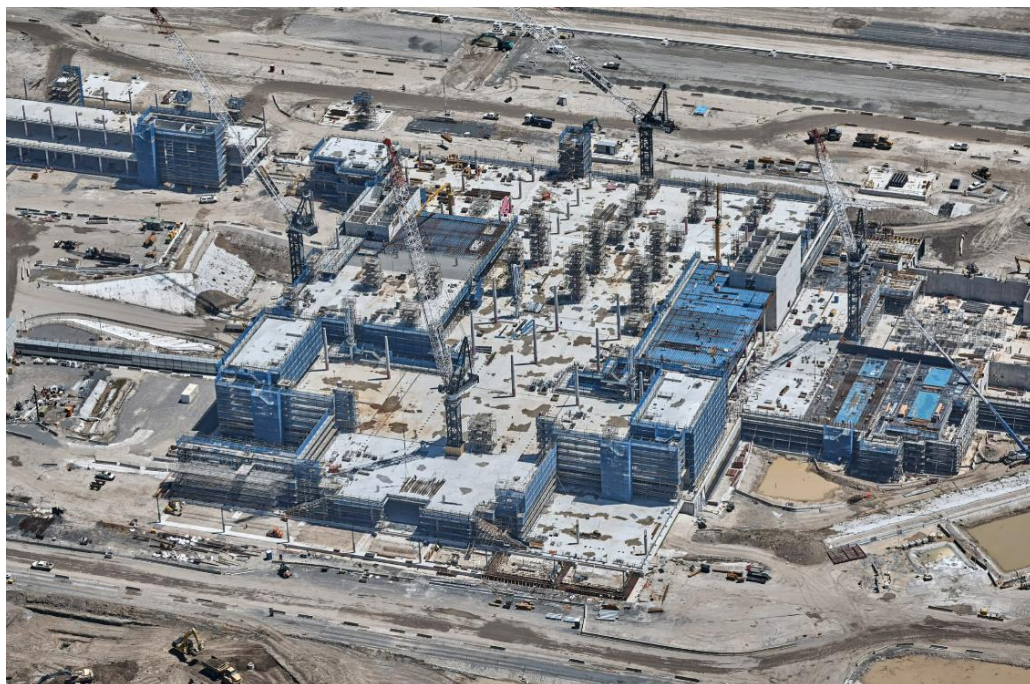
Aerial photo of the terminal, taken February 2023