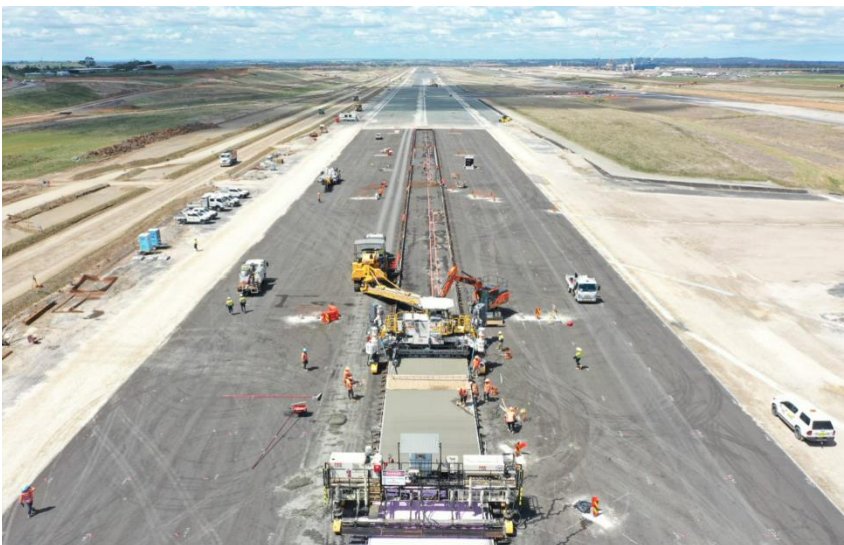
Aerial photo of the runway, taken February 2023

Over the next three months, the ACP project will continue to develop. Work will include installation of drainage systems, final earthworks for the perimeter road, constructing the runway (layering road base and concrete), and installing lighting and utilities infrastructure.